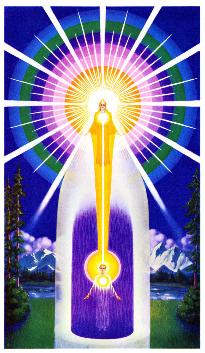
The Magic Presence