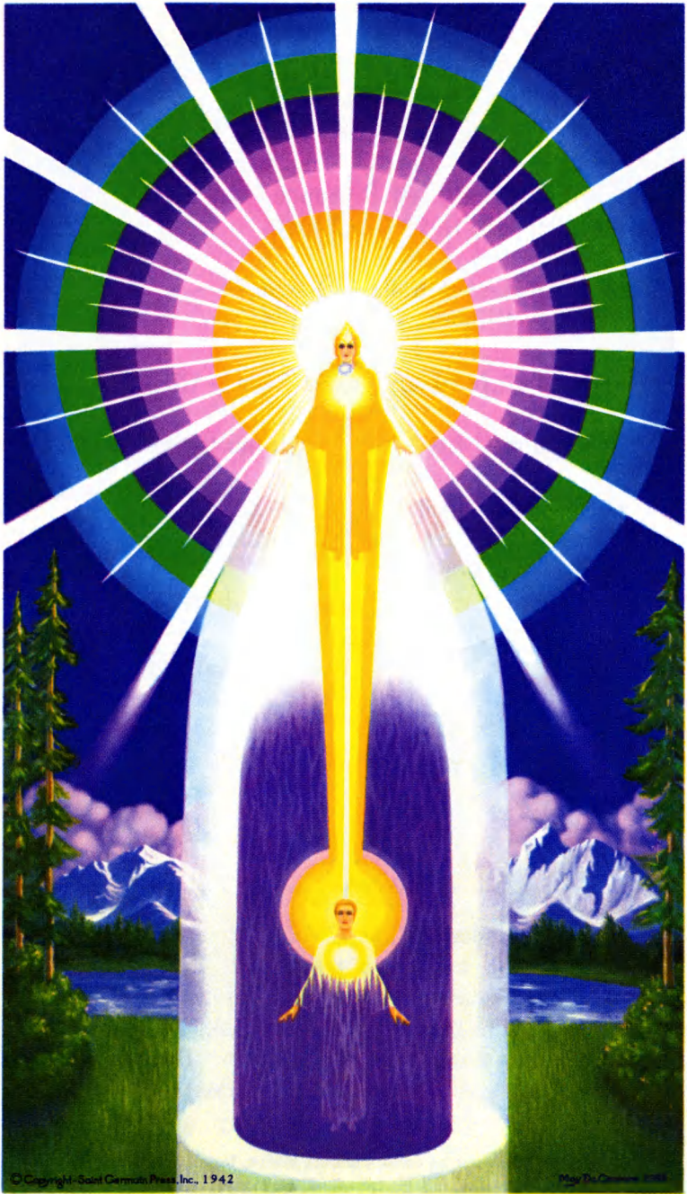
The Magic Presence