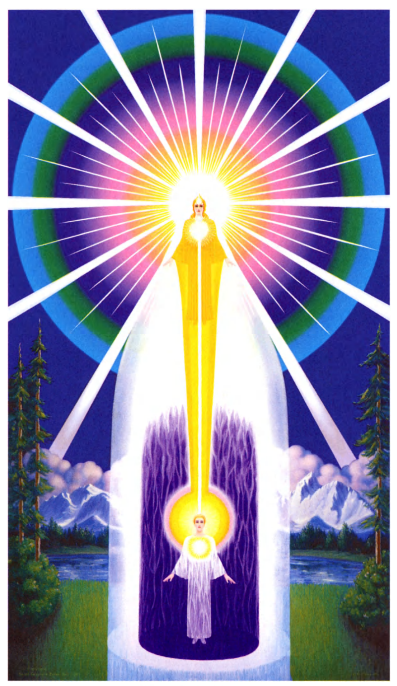
The Magic Presence