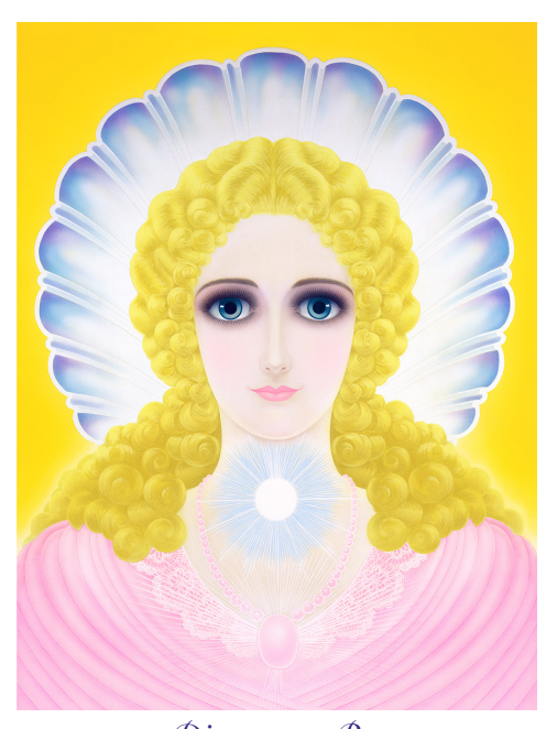
Discourse By BLESSED GODDESS OF PURITY

Chicago, Illinois October 30, 1960 Record CD 695