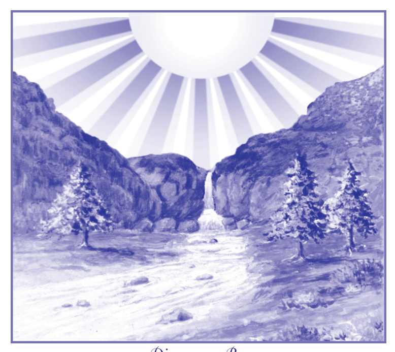
Discourse By BLESSED ELOHIM OF PURITY

Chicago, Illinois January 14, 1954 Record CD 132