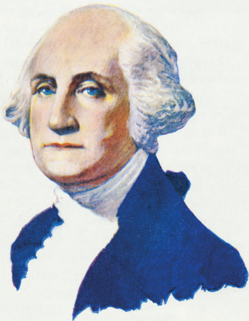
General George Washington