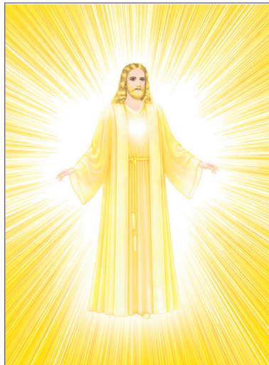
Beloved Master Jesus

There is another very important reason for His requesting this; and that is, in the sinister force’s determination to wipe out any recognition of the Christ, those of mankind who do give recognition to His Presence or to the great Cosmic Christ Love and Light of Life’s Perfection, He will amplify