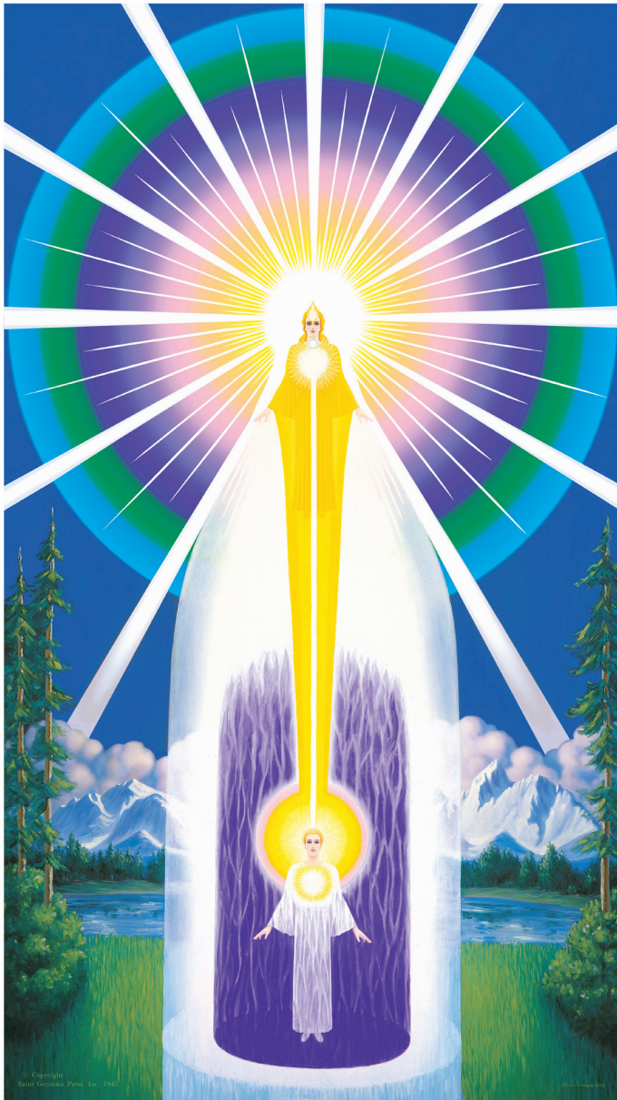
The Magic Presence