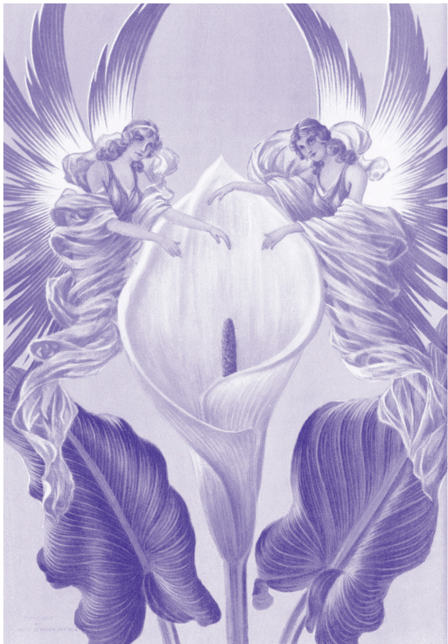
IMMAGINE DIPINTO DALLA GALLERIA DI MADONNA ENNE SOLE