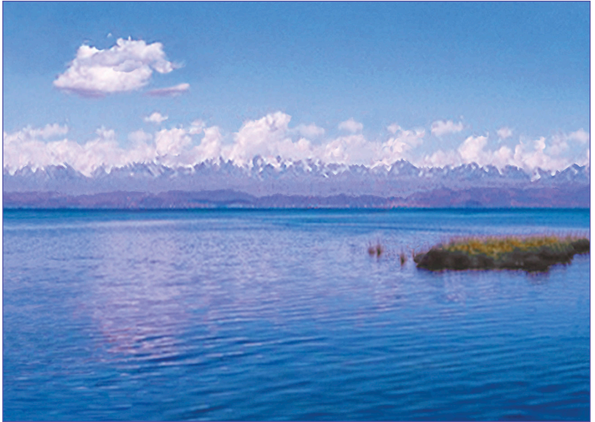
GOD MERU • LAKE TITICACA