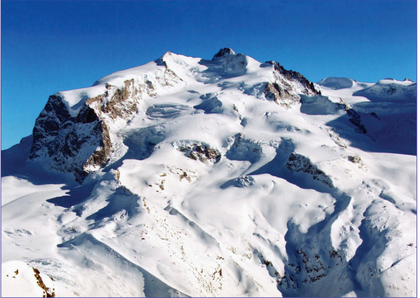
GOD OF THE SWISS ALPS • MONTE ROSA